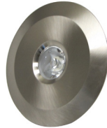
Big Trim (BN only)